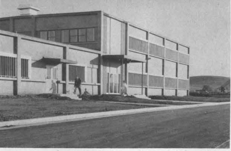
BEFORE AND AFTER views of plant construction of the Livermore Branch show some of the progress made in the two years since the Branch was opened. At left is a portion of the area before construction started, showing an old barracks building later torn down and a parking lot now the scene of office building which stands approximately on the site of the old barracks location.

more came from a professional firm of planners, called in to survey the city area and to make recommendations for channeling future expansion. They came up with a plan, based on an estimated 1980 population of 60,000.